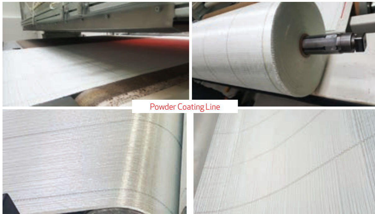
Powder Coating Line