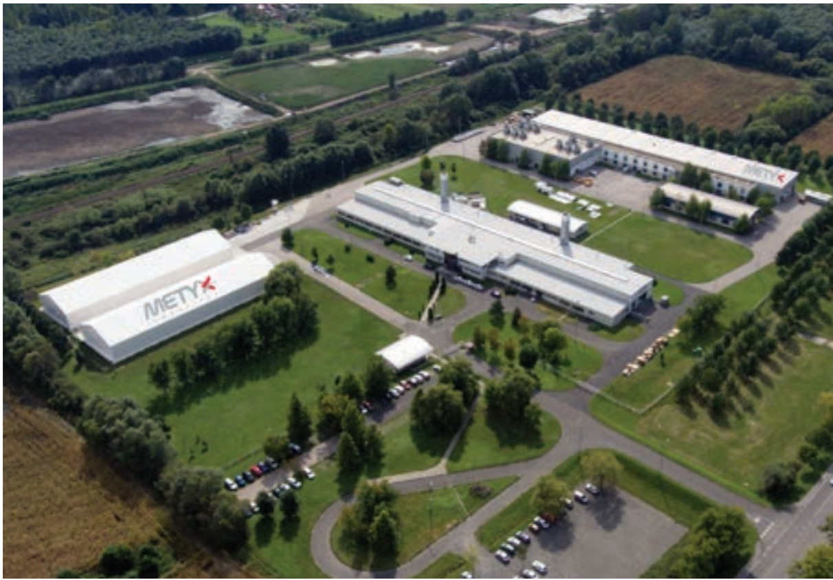
METYX HUNGARY, Kaposvár