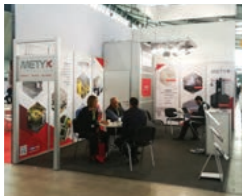
COMPOSITES EUROPE 2018