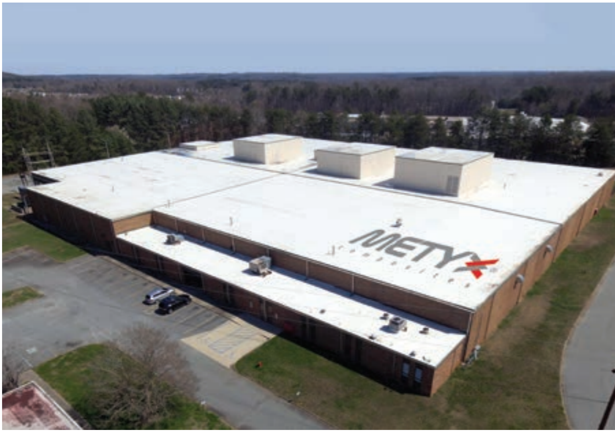
METYX USA, Gastonia, NC