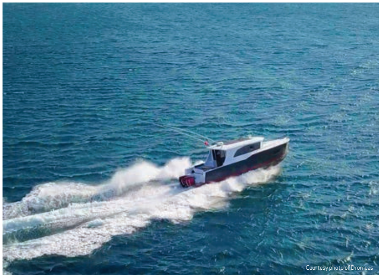
Courtesy photo of Dromeas