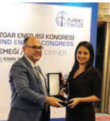
TURKISH WIND ENERGY CONGRESS 2018

METYX products were chosen by Sirena Marine because of a combination of the outstanding technical product performance and the fast, high quality, reliable service provided. ■